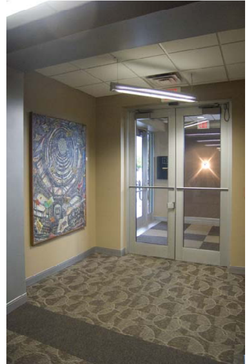
Newly renovated lobby area welcomes visitors and guests.